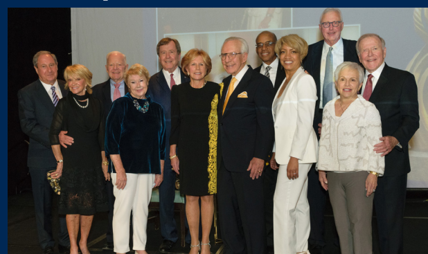
2021 Folsom Award Co-Chairs