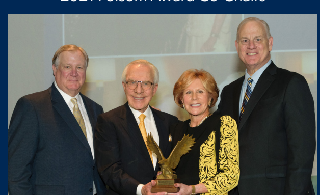
2021 Folsom Award Presentation