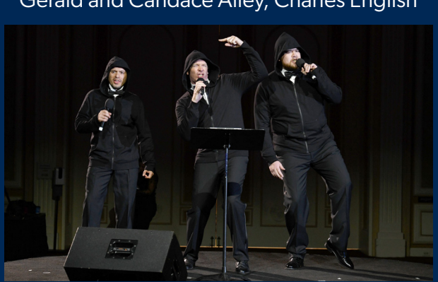
Eminem's "Lose Yourself"